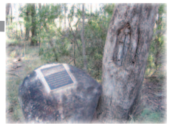
Owens Scrub Tree Plaque