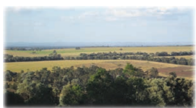
View from Mt Basalt