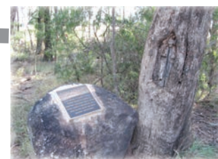
Owens Scrub Tree Plaque