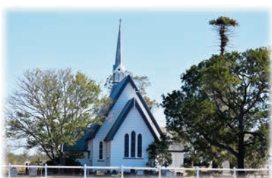
Church of All Saints Yandilla