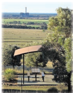
Picnic table and view from Mt Basalt to Power Station